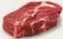
CHUCK CENTER ROAST