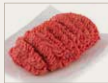
85/15 GROUND BEEF