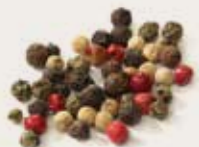
MIX OF PEPPERS