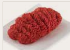
95/5 GROUND BEEF