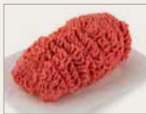
80/20 GROUND BEEF