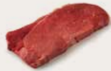
TOP ROUND STEAK