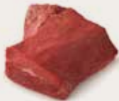
BOTTOM ROUND ROAST