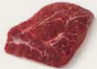
FLAT IRON STEAK