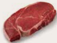
TOP SIRLOIN STEAK